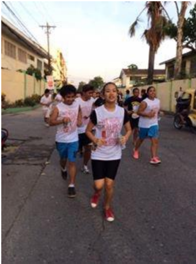
On the actual run