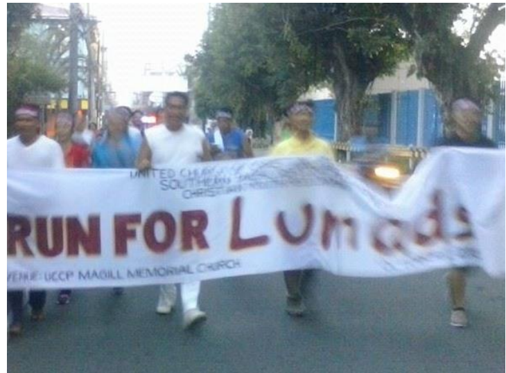
Runners while holding the banner of Run for Lumads