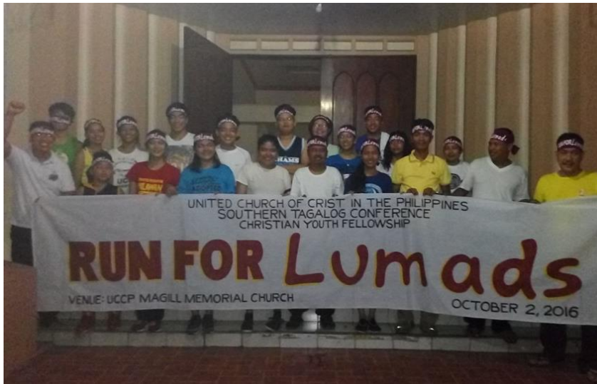
Some of the Run for Lumads participants proudly posed while holding their banner