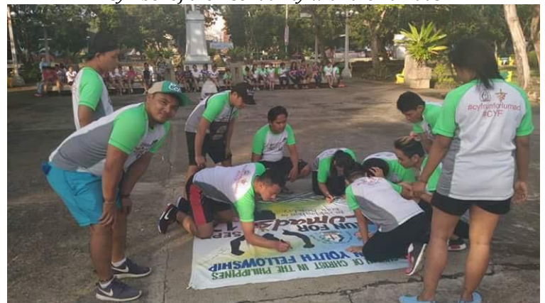
CYF while signing the Run for Lumads Tarpaulin as a symbol of their solidarity with the Lumads