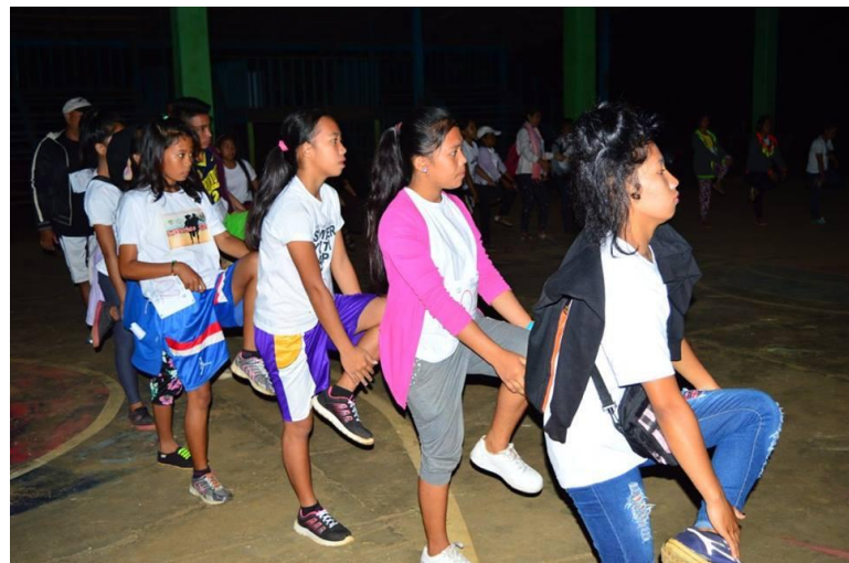
Warming up for the run