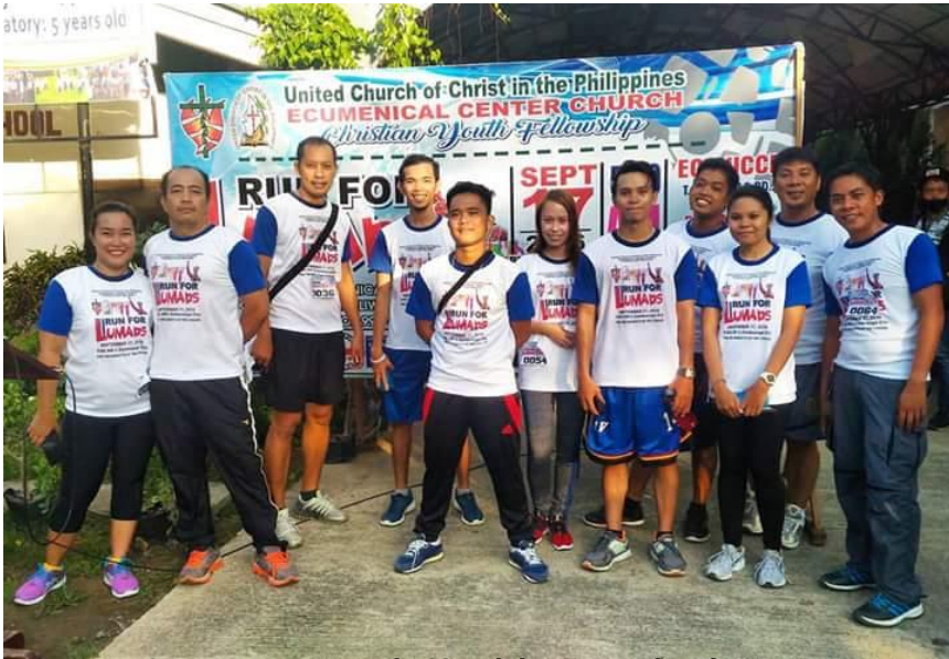
Some participants of DCSZ while posing after the run