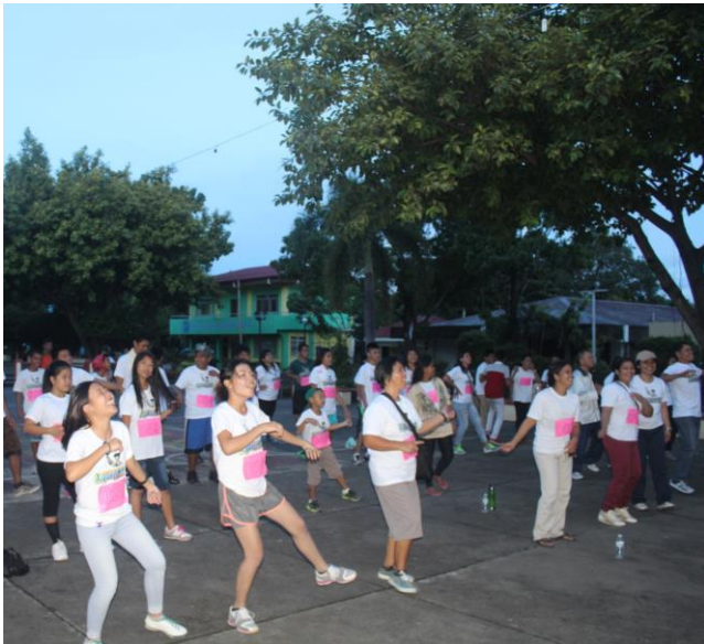
OMAC Delegation dancing the One Billion Rising