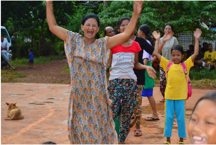
An IP women while happily welcoming those who finished the run