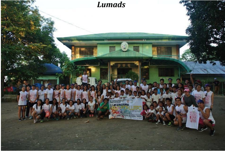
Delegation of NDDC and SMDC Run for Lumads