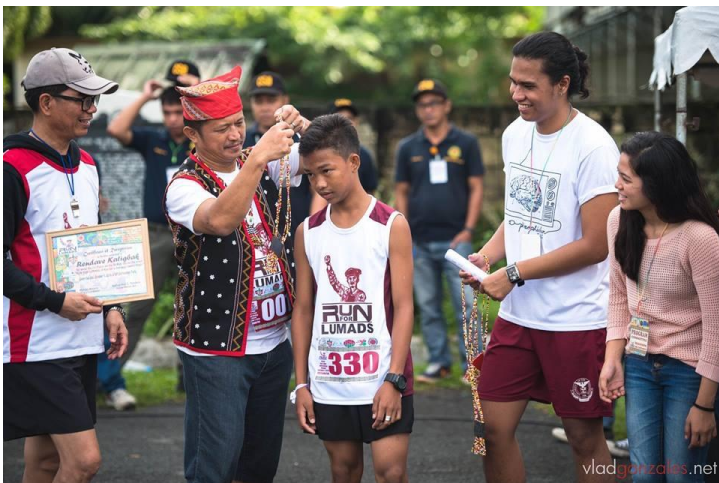
A participant from Los Baños who won the first place while being awarded by an IP leader and other partner organisations