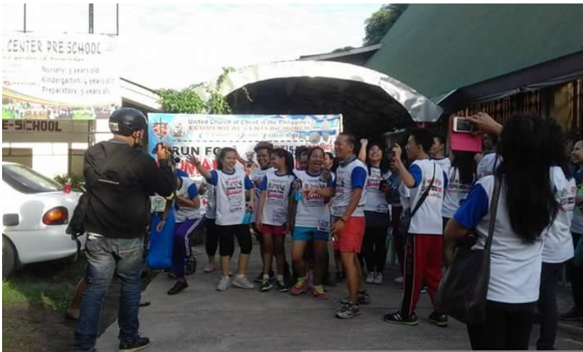
DCSZ posing for the local TV station coverage