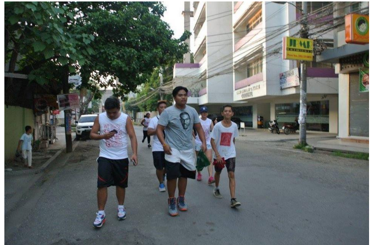
CYF of NDDC and SMDC on their actual run