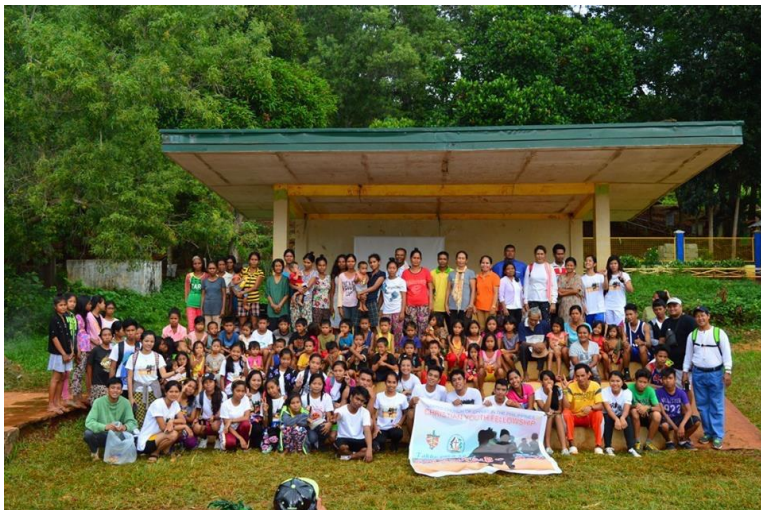
The whole PAC Run for Lumads delegation including Indigenous people participants