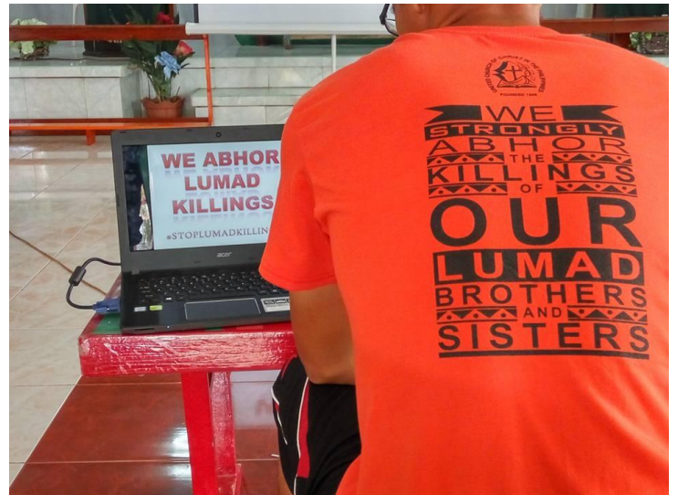
One of the CYF organisers while preparing for the run for lumads presentation