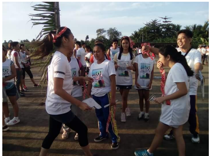
CYF were filled with joy as they receive their certification that symbolises their participation in a campaign for lumads