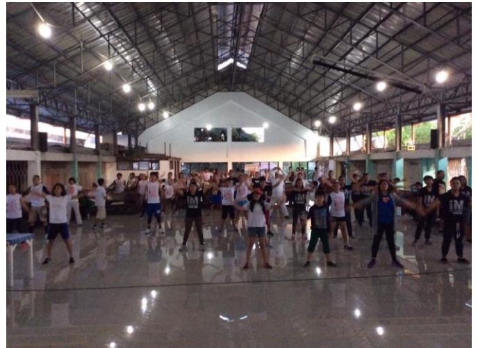
Some CYF as they run for lumads CYF warming up for the run