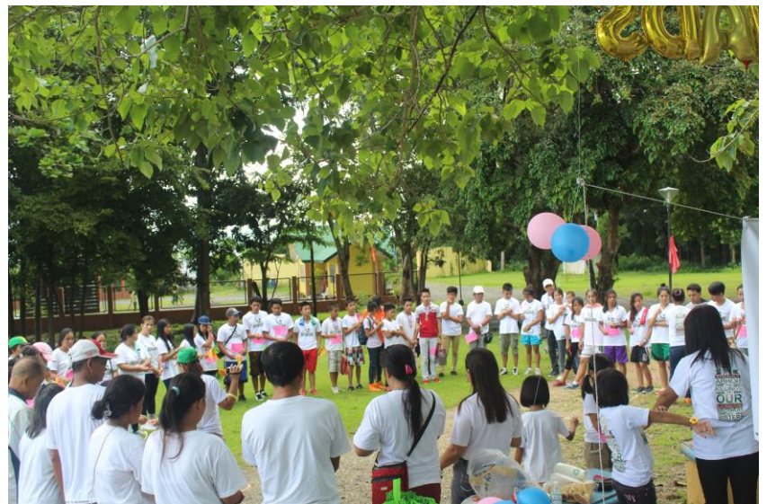
Participants gather formed a unity circle while praying for the Lumads and other indigenous peoples in the Philippines