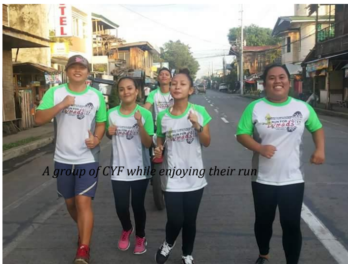
DCNM CYF during their actual run