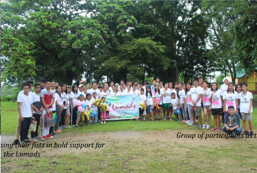
Group of participants as they prepare for the run