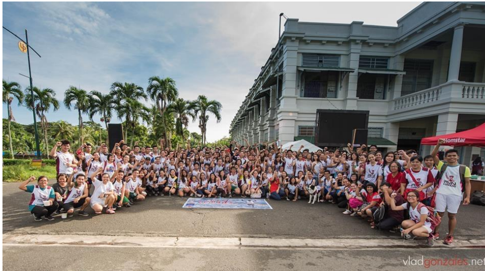
Some of the delegation of CALABARZON RUN for Lumads posed after the run