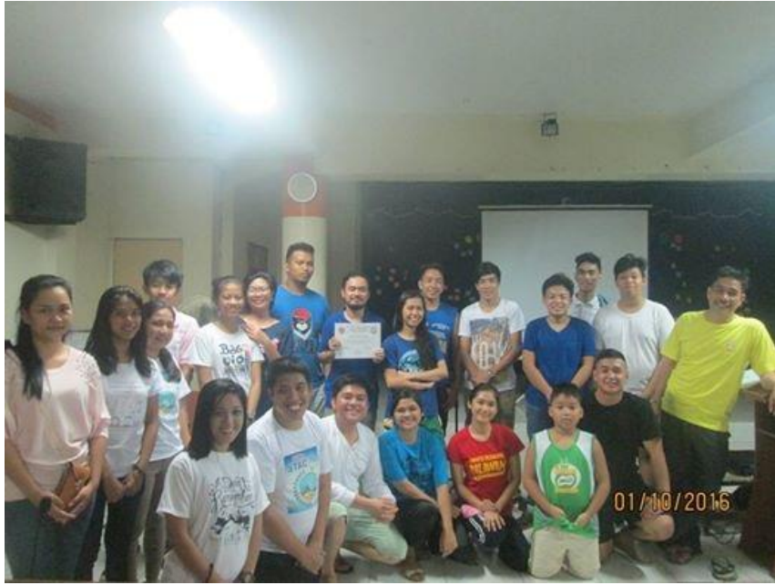
Some of the participants of the Run for Lumads attended an open forum a night before the Run