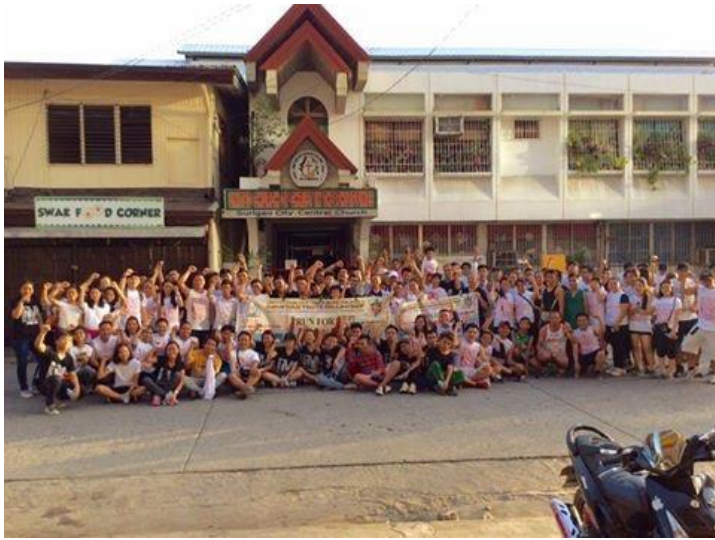
Participants of SDDC in their photo ops