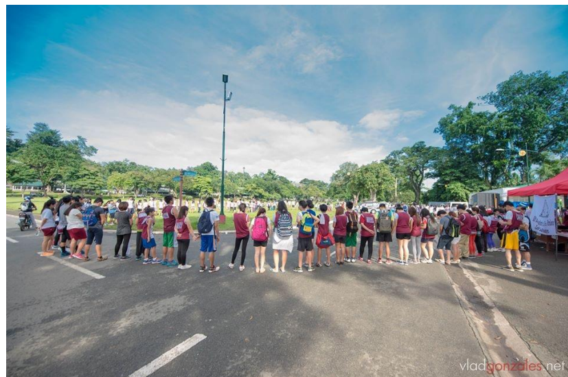
The delegation formed a big unity circle while praying for the struggling IPs including Lumads and all vulnerable sectors of our society