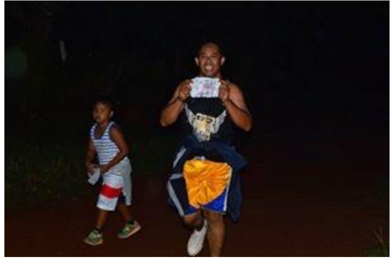
One of the church workers with his child joining the Run for Lumads