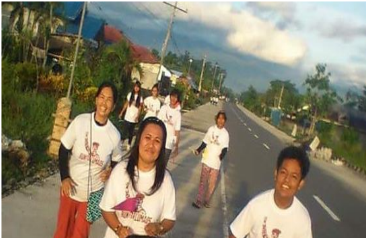
A CYF together with the CWA participants