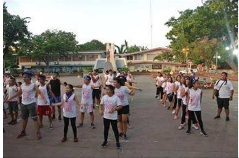
CYF in their stretching activity before the run

CYF posing excitedly before the run CYF were filled with joy as they receive their certification that symbolises their participation in a campaign for lumads