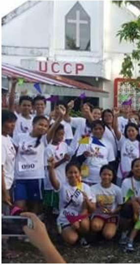
OMC Delegation raising their fists in bold support for the Lumads