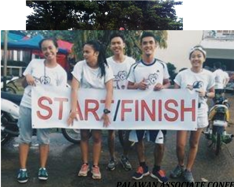
PALAWAN ASSOCIATE CONFERENCE (PAC)