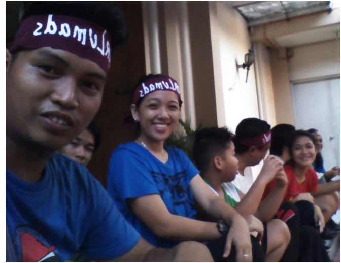
STC CYF Officers showing their excitement before the actual run