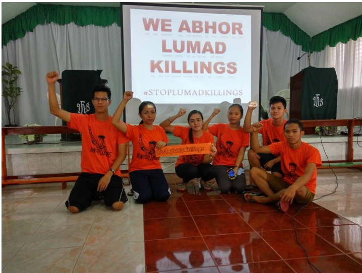
CYF Run for Lumads organiser posing before the actual run