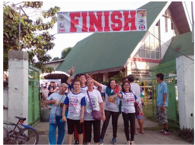
Participants enjoying their moments together after reaching the finish line