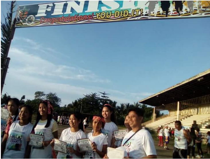
Participants while posing after finishing and receiving the certificates