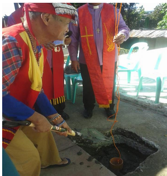
An elder Datu does his fair share of shoveling cement mix into the ground.