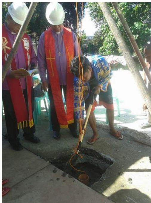
A Datu shoveling cement mixture into the ground.