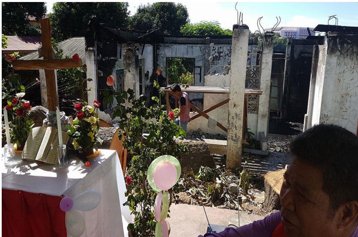
The burned Haran House was used as backdrop for the groundbreaking ceremony.